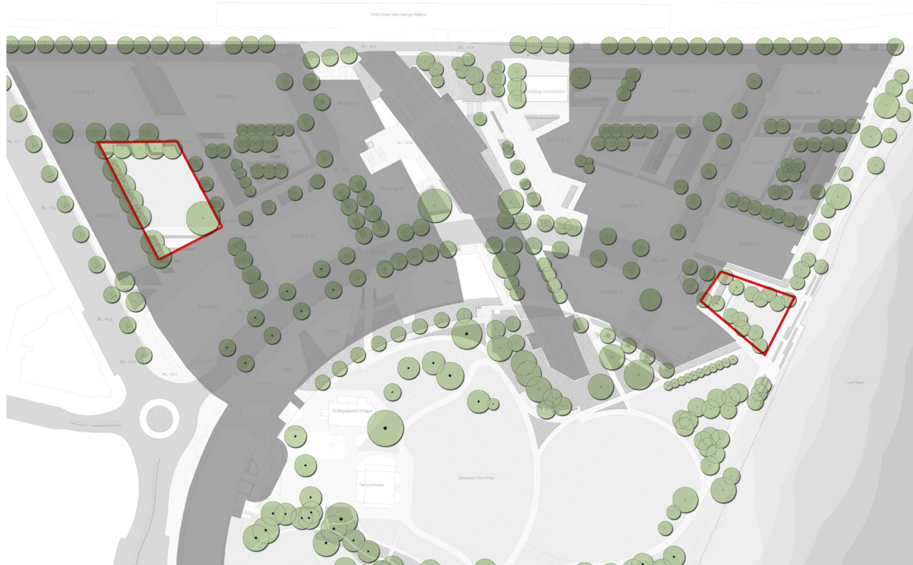
Trees and Basement Plan