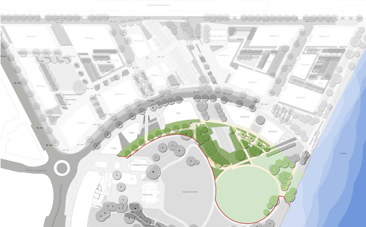
Park Frontage Improvement